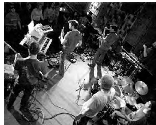
Eleven Eyes 5th anniversary show 9 pm Saturday, June 9 WOW Hall • $7 adv., $8 door