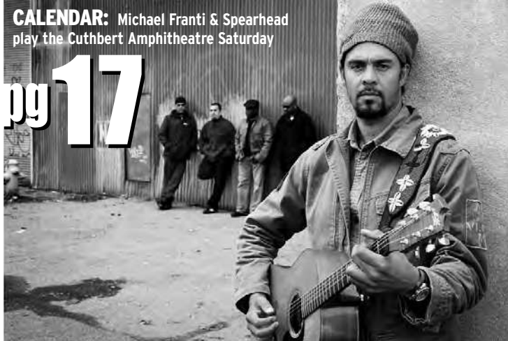
CALENDAR: Michael Franti & Spearhead play the Cuthbert Amphitheatre Saturday