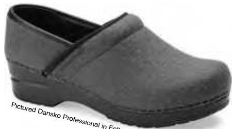
Pictured Dansko Professional in Felt

Dansko Professionals available in Non-Leather Materials! Come in to see our entire selection of non-leather shoes and preview a selection of the Fall 2007 Dansko line! THIS SATURDAY, APRIL 7 • 10:30AM-6PM