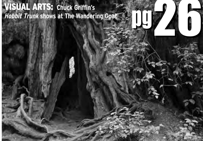
VISUAL ARTS: Chuck Griffin's Hobbit Trunk shows at The Wandering Goat