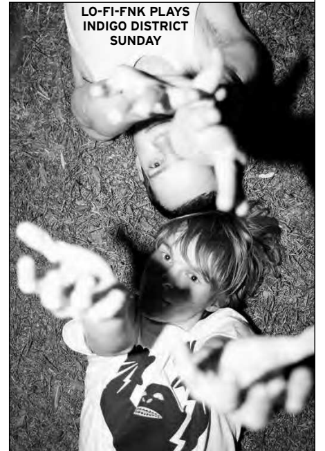
LO-FI-FNK PLAYS INDIGO DISTRICT SUNDAY

BLACK FOREST Caught in the Act Karaoke-10 COUNTRY SIDE Karaoke w/Kim-9