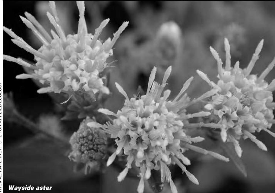
THOMAS KAYE, INSTITUTE FOR APPLIED ECOLOGY