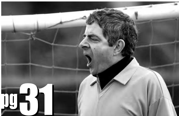
MOVIES: Keeping Mum opens Friday at the Bijou.