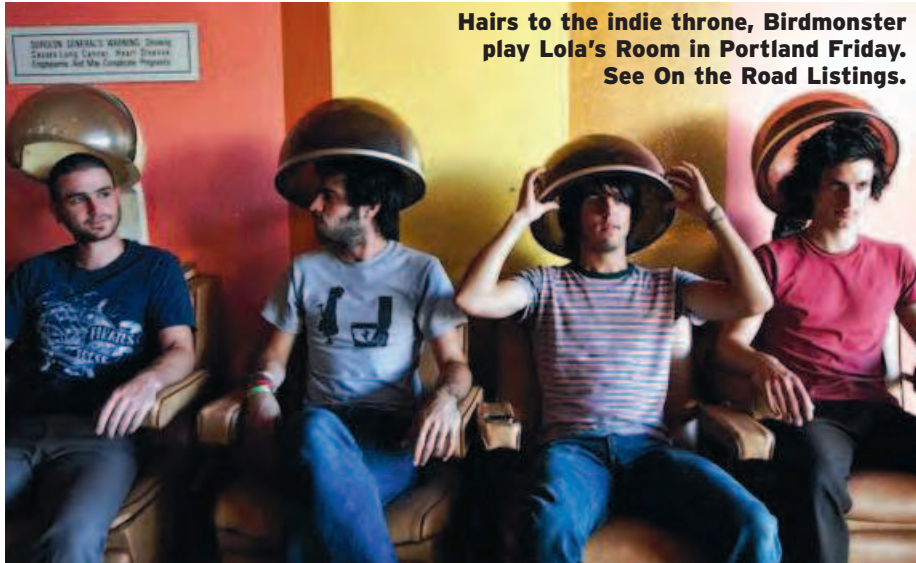
Hairs to the indie throne, Birdmonster play Lola's Room in Portland Friday. See On the Road Listings.