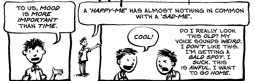
A 'YOUNG-HAPPY-ME' AND AN 'OLD-HAPPY-ME' WOULD GET ALONG GREAT!