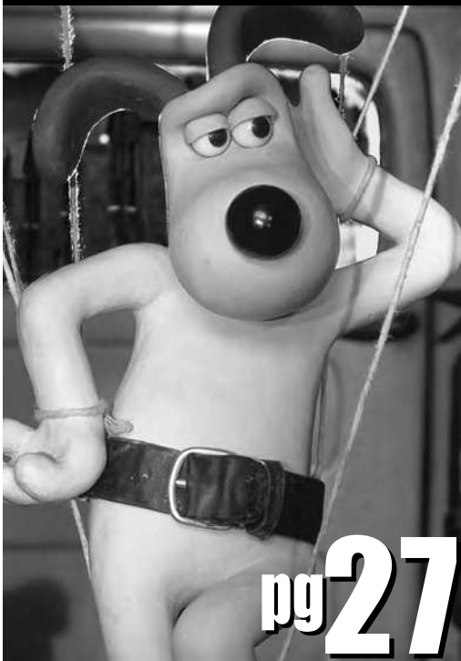
TAKASHI SEDAI, NEW LINE CINEMA, 2005