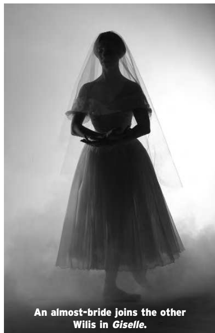
EUGENE BALLET COMPANY, 2005

As Giselle's courtship with Loys blossoms into real love, she's devastated to find out that he is actually Count Albrecht, a philandering