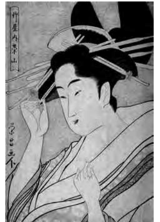
Chokosai Eisho, Eizan of the Takeya , c. 1790s, on loan from the Weatherspoon Art Museum, the University of North Carolina at Greensboro.

Location: 1430 Johnson Lane on the University of Oregon campus.