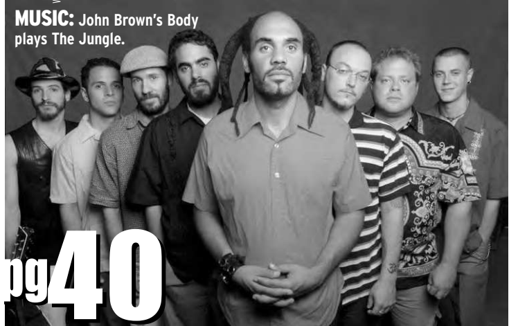
MUSIC: John Brown's Body plays The Jungle .