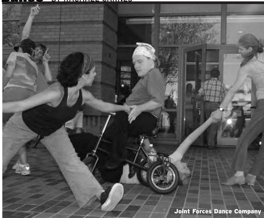
Joint Forces Dance Company