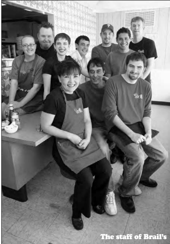
The staff of Brail's