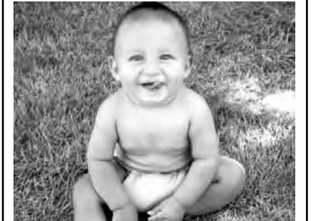
SALE ENDS 7/17/05

205 W. 5th AT CHARNELTON 485-1222 • MON-SAT 10-5:30 • SUN 12-5