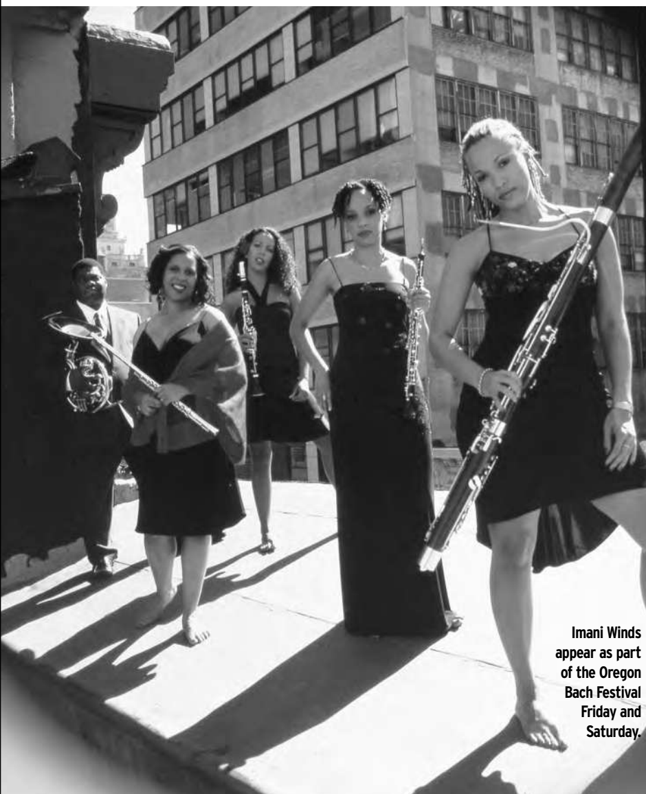
Imani Winds appear as part of the Oregon Bach Festival Friday and Saturday.