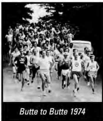
Butte to Butte 1974

running works ★ running works ★ running works