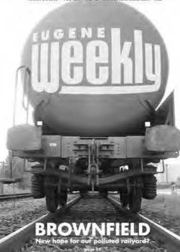
SCHOOL CHOICE • BILL MAHER • SUPERSUCKERS • ART OF DRAWING MARCH 24, 2005 • VOL. XXIV • NO. 13 • WWW.EUGENEWEEKLY.COM • FREE

architecture and design solutions for humanitarian crises.