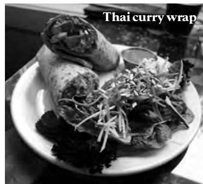
Thai curry wrap