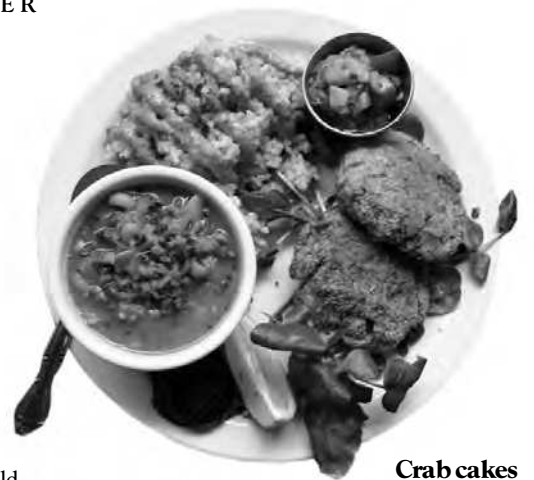
Crab cakes and roasted vegetable barley soup

"Having the restaurant has given us a forum to reach more people," Intaba said. "It's a place to show people different ways to live a good life, a life with beauty and culture. And really good food." ★