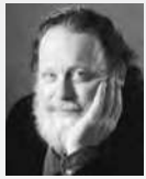
Peter Schickele, composer & narrator

A Simply Grand Opera Concert Version - NW Premiere — Screamingly Funny! Washington Post