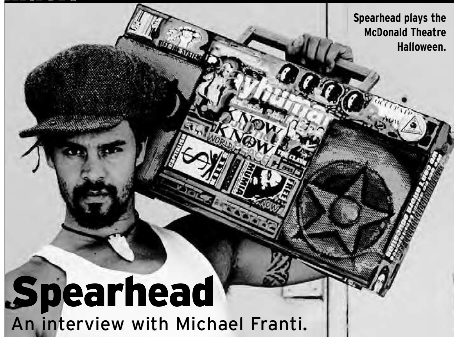
Spearhead plays the McDonald Theatre Halloween.