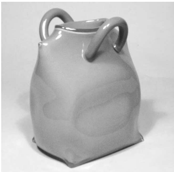
A glass vase featured in the Eugene Glass School auction and benefit dinner. See Friday.