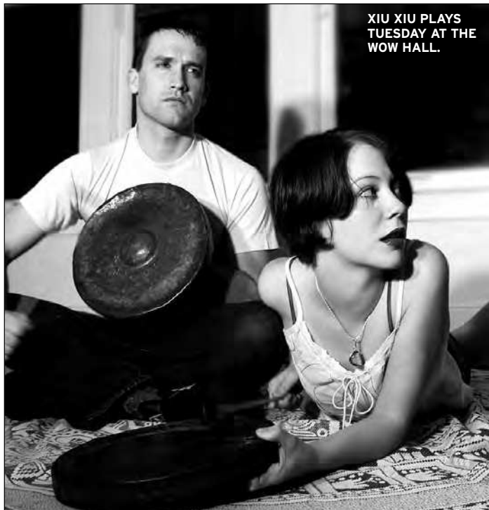
XIU XIU PLAYS TUESDAY AT THE WOW HALL.