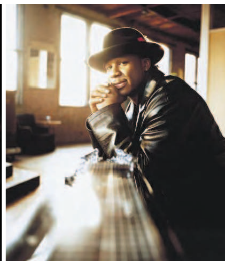
Eric Clapton and Robert Randolph play the Rose Garden. See July 28, On the Road.