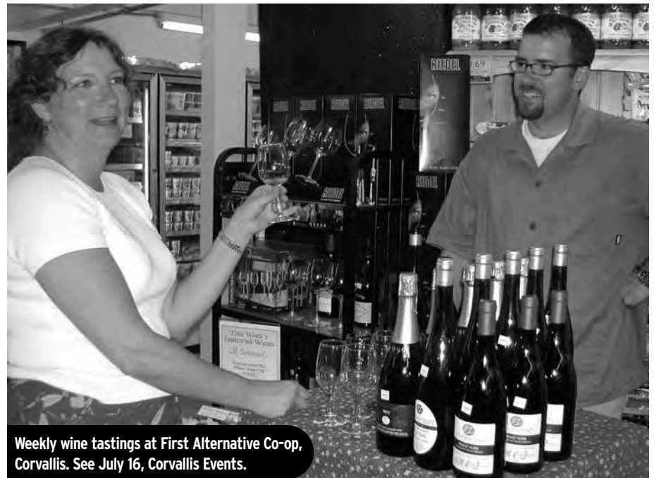
Weekly wine tastings at First Alternative Co-op, Corvallis. See July 16, Corvallis Events.

SPIRITUAL Inner light and sound meditation, 7 pm, PeaceHealth. For information call (503) 648-7380. FREE.