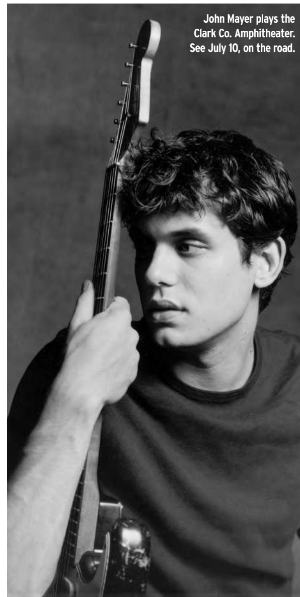
John Mayer plays the Clark Co. Amphitheater. See July 10, on the road.