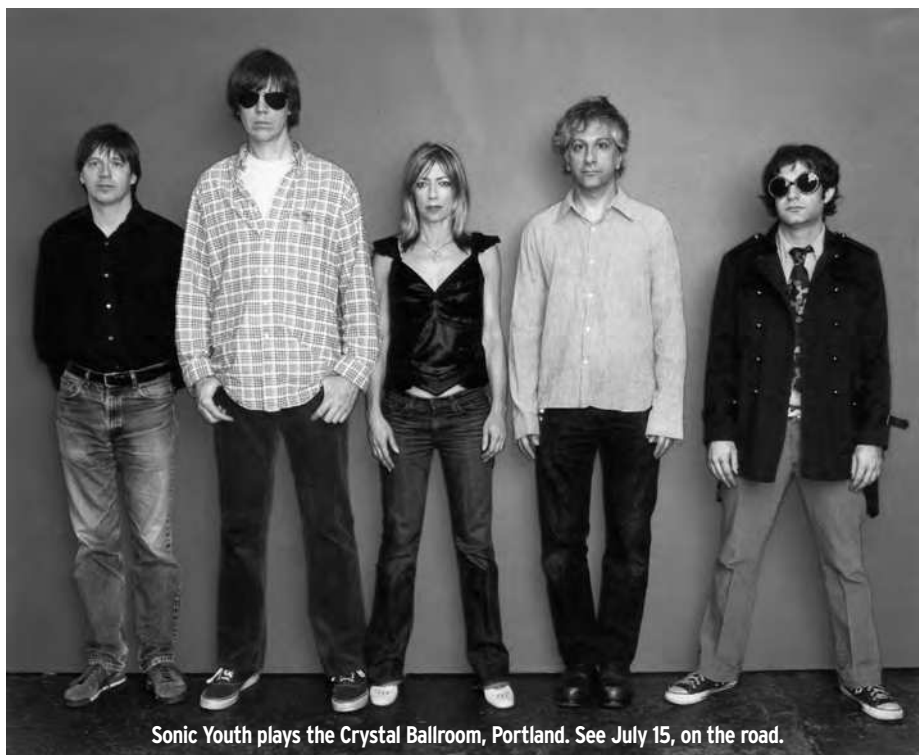
Sonic Youth plays the Crystal Ballroom, Portland. See July 15, on the road.

Sidewalk Chalk Art Festival features chalk for all and music by the