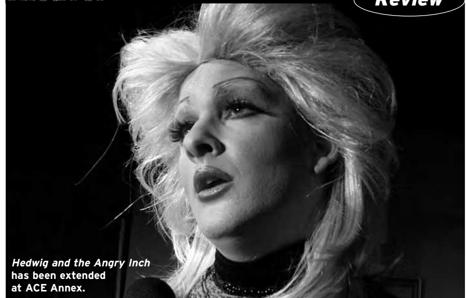
Hedwig and the Angry Inch has been extended at ACE Annex.