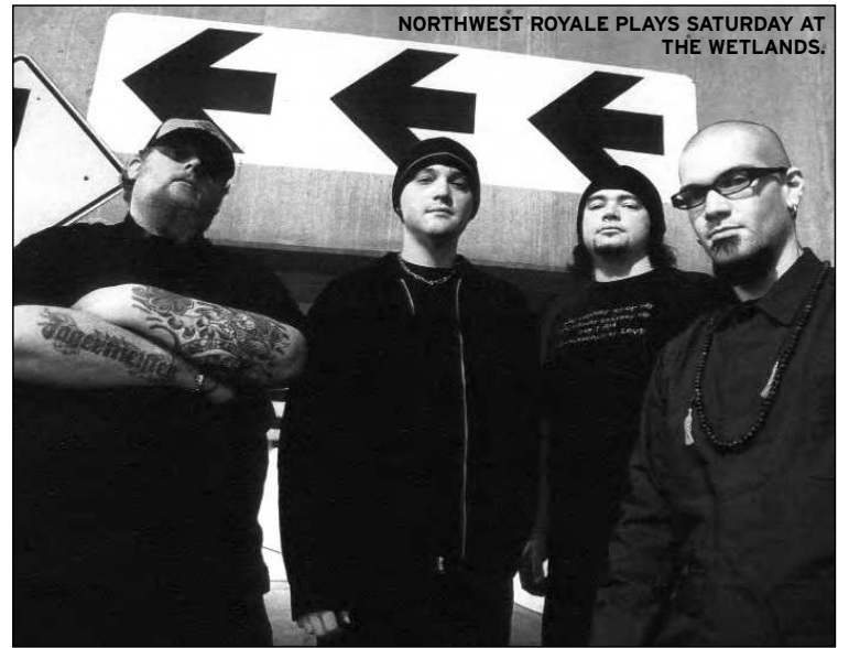
NORTHWEST ROYALE PLAYS SATURDAY AT THE WETLANDS.