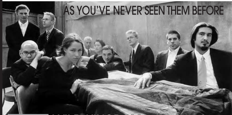
AS YOU'VE NEVER SEEN THEM BEFORE