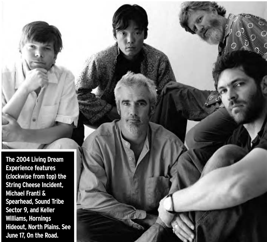
The 2004 Living Dream Experience features (clockwise from top) the String Cheese Incident, Michael Franti & Spearhead, Sound Tribe Sector 9, and Keller Williams, Hornings Hideout, North Plains. See June 17, On the Road.

JUNE 23 Mary Chapin Carpenter, Jim Lauderdale, 7 pm, Oregon Zoo, Portland. $18.