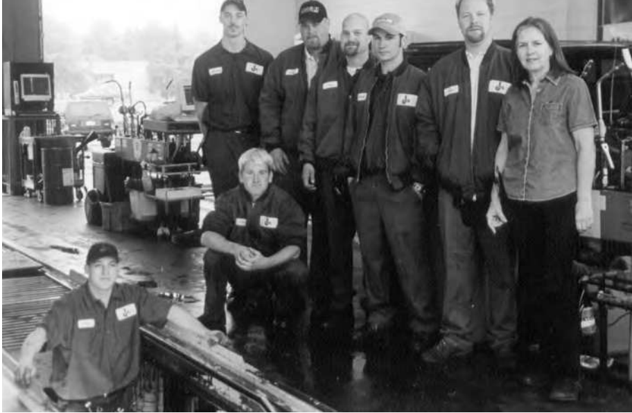
The West 11th Jiffy Lube crew