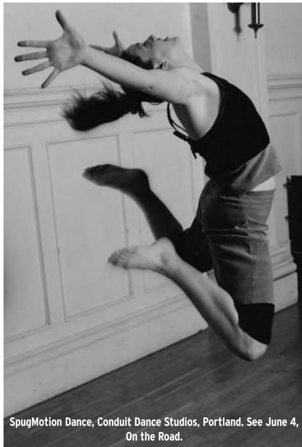
SpugMotion Dance, Conduit Dance Studios, Portland. See June 4, On the Road.

Barefoot in the Park continues. See Thursday, June 3.