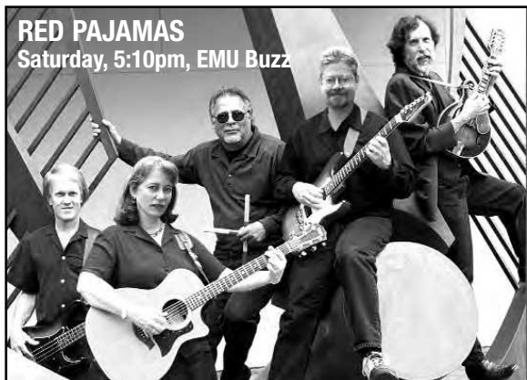
RED PAJAMAS Saturday, 5:10pm, EMU Buzz