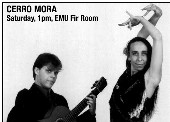
CERRO MORA Saturday, 1pm, EMU Fir Room