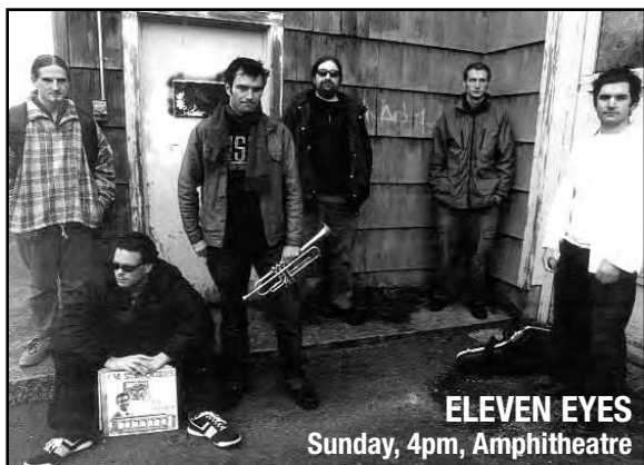
ELEVEN EYES Sunday, 4pm, Amphitheatre