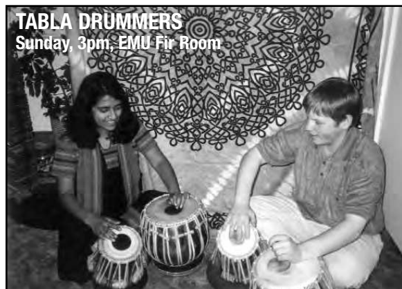
TABLA DRUMMERS Sunday, 3pm, EMU Fir Room