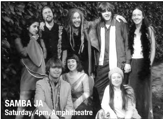
SAMBA JA Saturday, 4pm, Amphitheatre