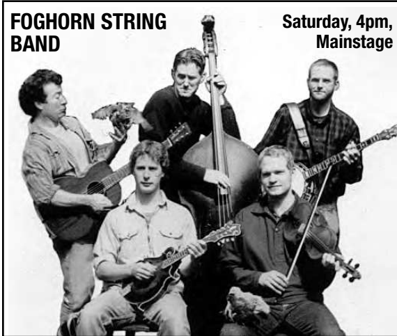
Saturday, 4pm, Mainstage