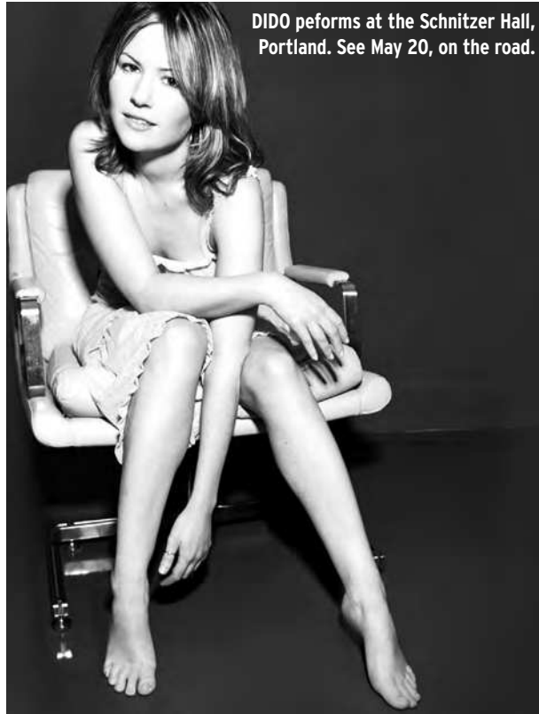
DIDO performs at the Schnitzer Hall, Portland. See May 20, on the road.

22nd Annual Oregon Homebrew & Microbrew Festival features tastings, music and more, to benefit Linn-Benton Food Share and Start Making a Reader Today, 3 to 9 pm, Benton Co. Fairgrounds. $8 includes a glass and two tastes.