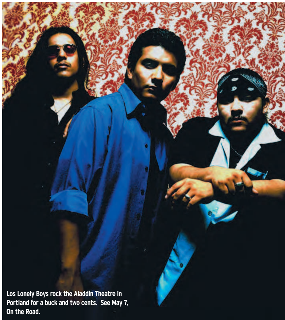
Los Lonely Boys rock the Aladdin Theatre in Portland for a buck and two cents. See May 7, On the Road.

SPIRITUAL Zen meditation and Anjo closing ceremony, 7 pm, Eugene Zendo. 302-4576. FREE.