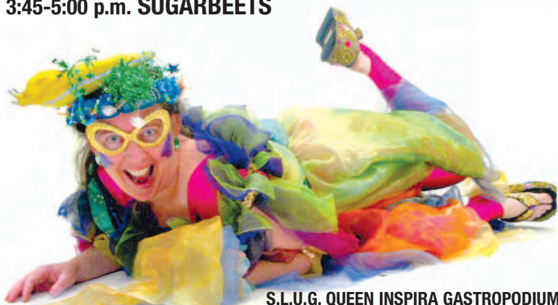
S.L.U.G. QUEEN INSPIRA GASTROPODIUM