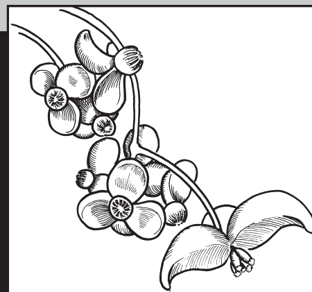
Silver Bells™ Akebia Vine. Vigorous, easy-to-grow, profuse clusters of light pink and reddish-purple, fragrant flowers.