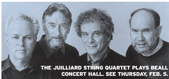
THE JUILLIARD STRING QUARTET PLAYS BEALL CONCERT HALL. SEE THURSDAY, FEB. 5.

FEB. 4 Juilliard String Quartet, 7:30 pm, La Sells Stewart Center, OSU. $20.