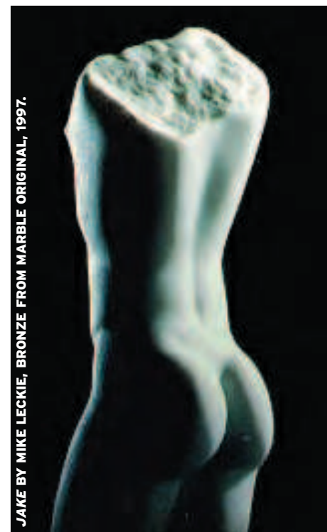
JAKE BY MIKE LECKIE, BRONZE FROM MARBLE ORIGINAL, 1997.