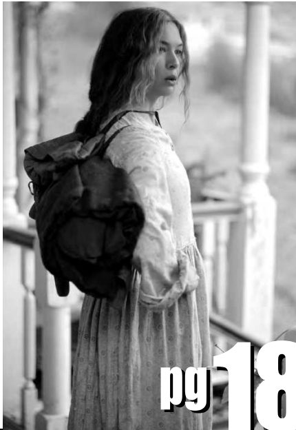
PHIL BRAY, MIRAMAX, 2003.