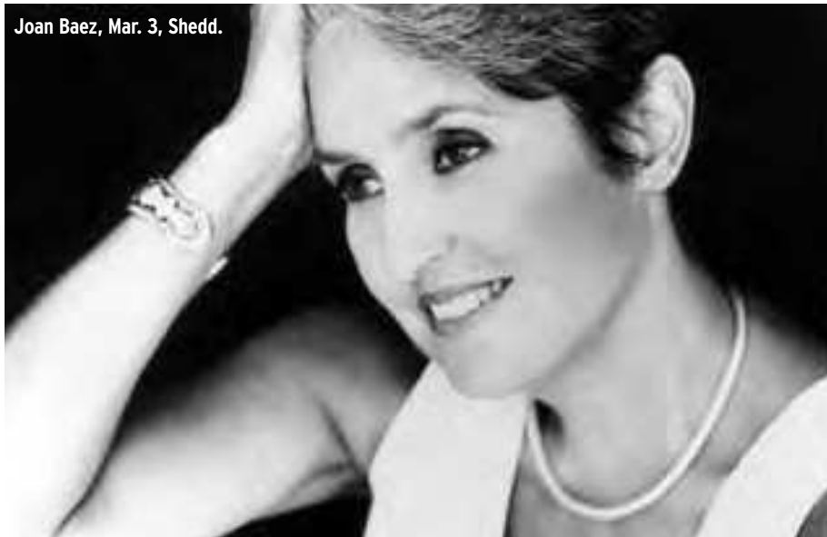
Joan Baez, Mar. 3, Shedd.