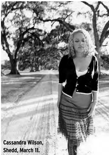
Cassandra Wilson, Shedd, March 11.