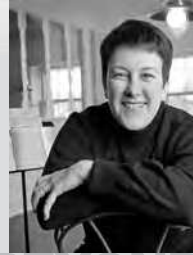
BEYOND All Expectations