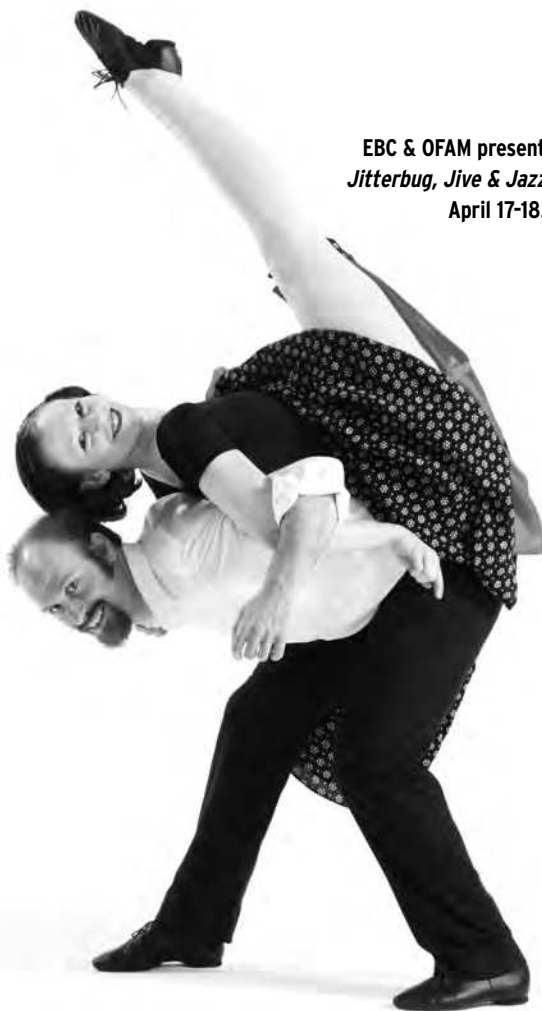
EBC & OFAM present Jitterbug, Jive & Jazz April 17-18.

The space here is too small to detail or even mention every notable upcoming dance event, so check EW each week for additional coverage. I'll do my best to keep you updated on what's shaping up to be a great season. EW