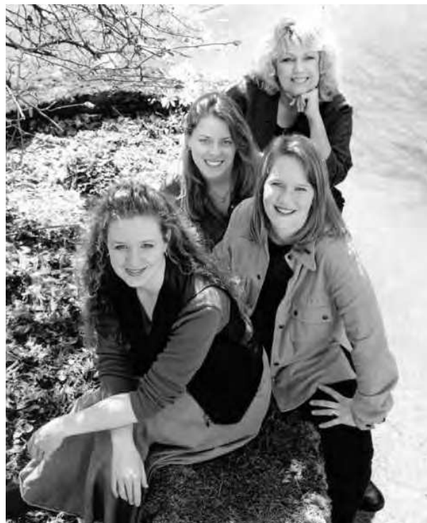
MISTY RIVER COURSES THROUGH STAYTON'S STAR CINEMA. SEE THURSDAY, JAN. 15, ON THE ROAD.

Shamanic Animal Communication Circle, 7:30 pm to 9:30 pm, Spirit Healer Farm, 25828 Parker Lane, Veneta. 935-4996. FREE.