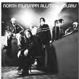
North Mississippi Allstars Polaris