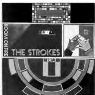
Strokes Room On Fire