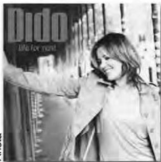
Dido Life For Rent