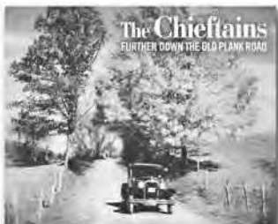
Chieftains Further Down The Old Plank Road