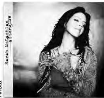
Sarah McLachlan Afterglow