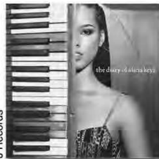
Alicia Keys Diary Of Alicia Keys Bonus DVD