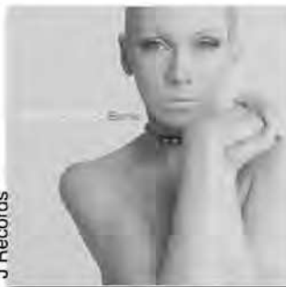
Annie Lennox Bare