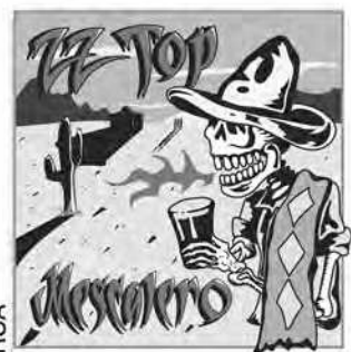
ZZ Top Mescalero