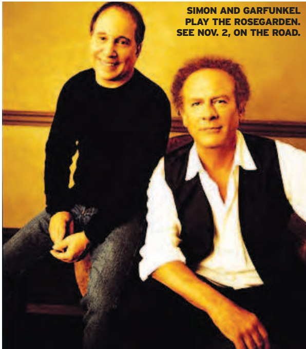
SIMON AND GARFUNKEL PLAY THE ROSEGARDEN. SEE NOV. 2, ON THE ROAD.

Zen meditation, 7:15 pm, Eugene Zendo. 302-4576. FREE.