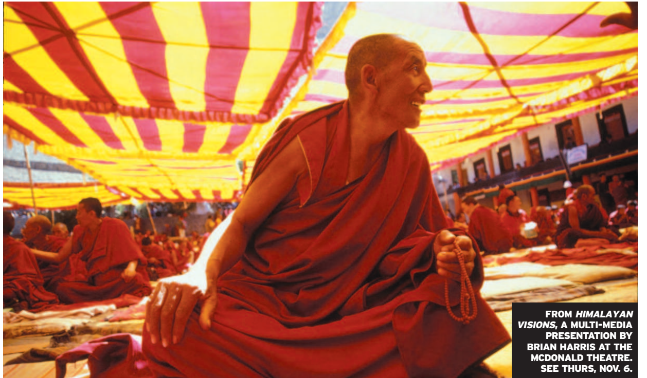
FROM HIMALAYAN VISIONS, A MULTI-MEDIA PRESENTATION BY BRIAN HARRIS AT THE MCDONALD THEATRE. SEE THURS, NOV. 6.

"Courageous Women of Faith" presentation, 7 pm, Unity of the Valley Church. FREE.