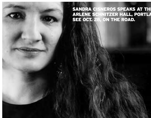
SANDRA CISNEROS SPEAKS AT THE ARLENE SCHNITZER HALL, PORTLAND. SEE OCT. 28, ON THE ROAD.

One-hour fast bike rides continue. See Thursday, Oct. 23.