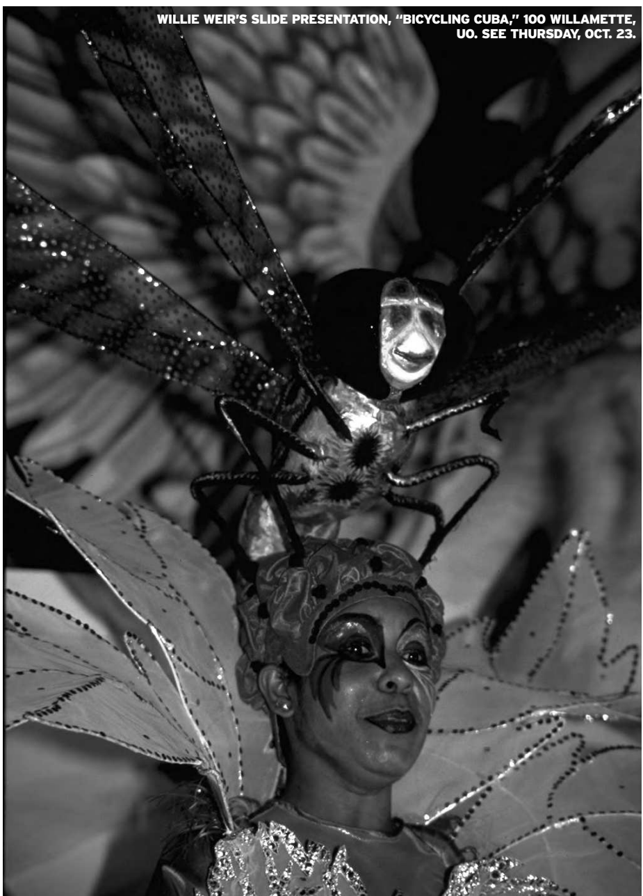
WILLIE WEIR'S SLIDE PRESENTATION, "BICYCLING CUBA," 100 WILLAMETTE, UO. SEE THURSDAY, OCT. 23.

KIDSTUFF Playgroup for moms and newborns to 2-year-olds, 10 am, Bambini. FREE.