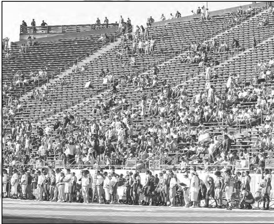
Brian Schapper, BODOGSPORTS.COM

In a game that was not as close as the final score indicated, Oregon's tenth-ranked Ducks did not show up for their first conference game against the defending Pac-10 champion Washington State Cougars and experienced a 55-16 reality check before a sun-baked crowd at Autzen Stadium. As the shell shocked Ducks staggered back to the safety of their $3 million dollar locker room, they were, no doubt,