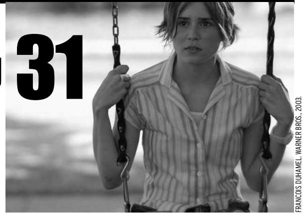
Alison Lohman stars in Matchstick Men , now at Cinema World and Cinemark.