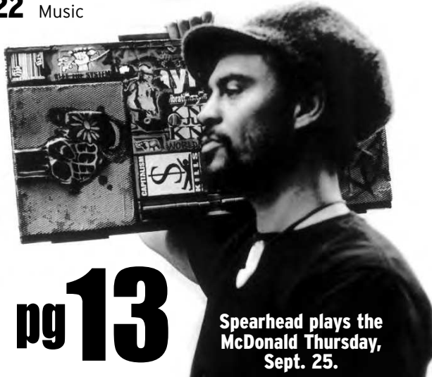
Spearhead plays the McDonald Thursday, Sept. 25.