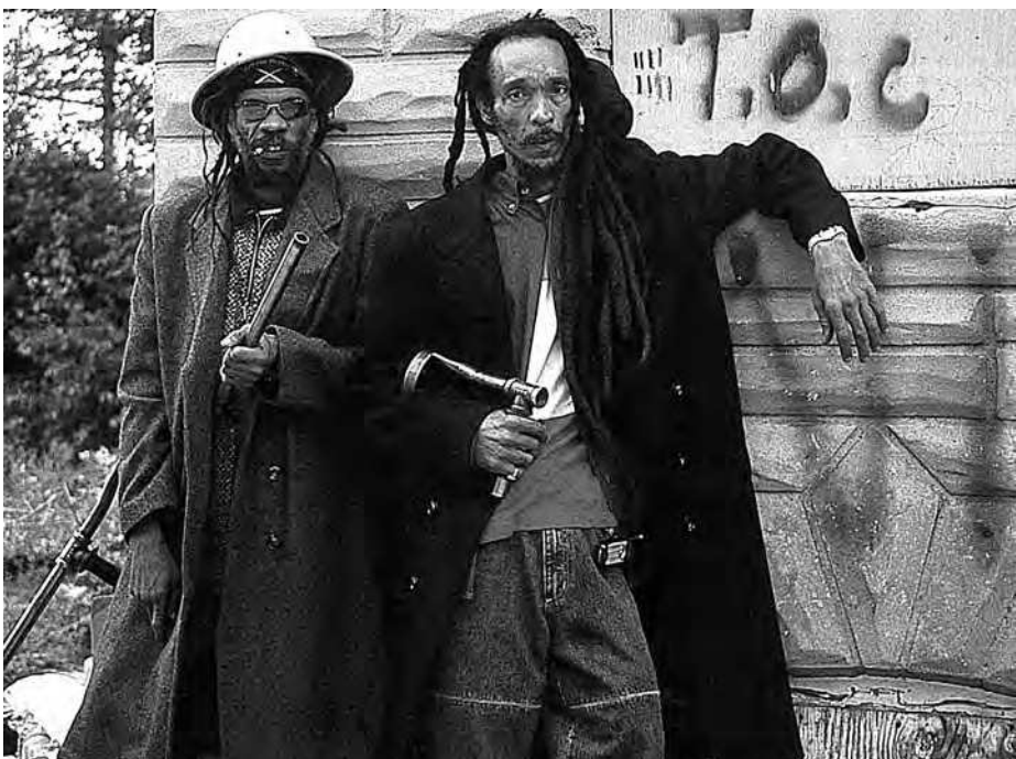
ISRAEL VIBRATION (ABOVE) OPENS FOR THE WAILERS AT MCDONALD THEATRE. SEE WEDNESDAY.

ARTS/VISUAL Labor Day open house features music by Fuzz, 1 to 5 pm today and tomorrow, LaVelle Vineyards, Elmira. $2.